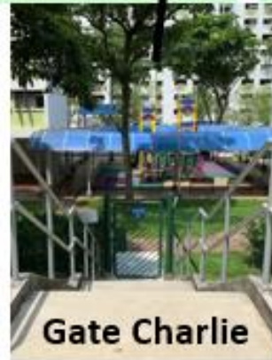
Gate Charlie Sec 3