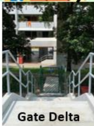
Gate Delta Sec 1