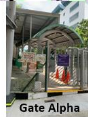
Gate Alpha Sec 4 & 5