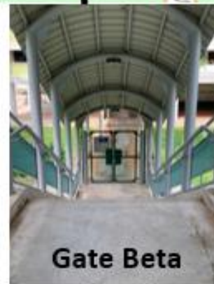
Gate Beta Sec 2